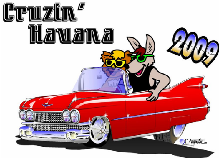
The dream cruise of the Rocky Mountain West!

You still have time to work on your cool ride! Havana Auto Parts will be providing the grand prize for the poker run again this year.